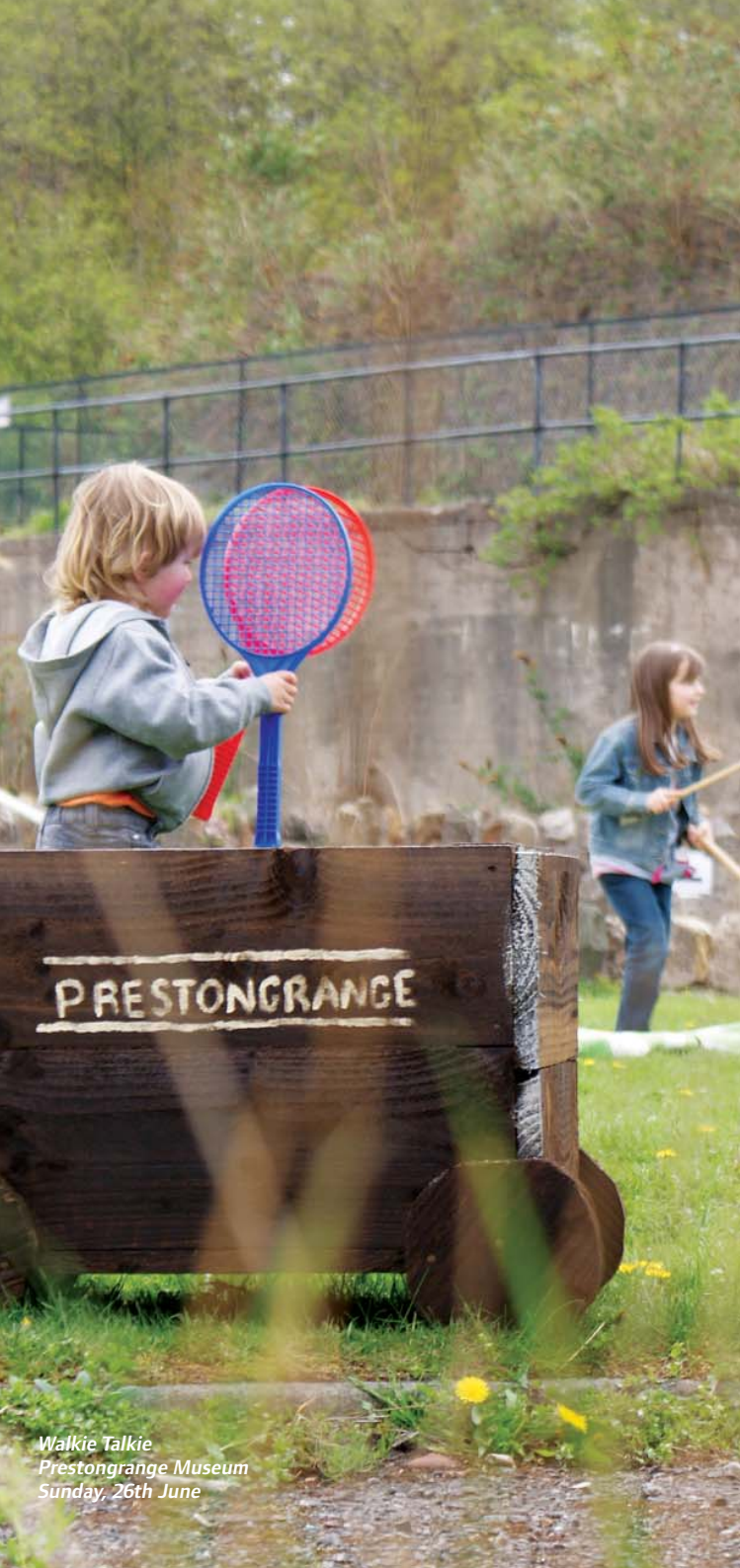
Walkie Talkie Prestongrange Museum Sunday, 26th June