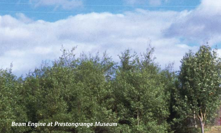
Beam Engine at Prestongrange Museum